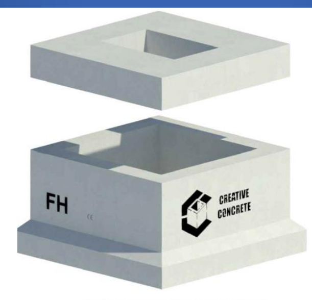
3D IMAGE: FIRE HYDRANT CHAMBER COMPLETE WITH 150mm COVER.